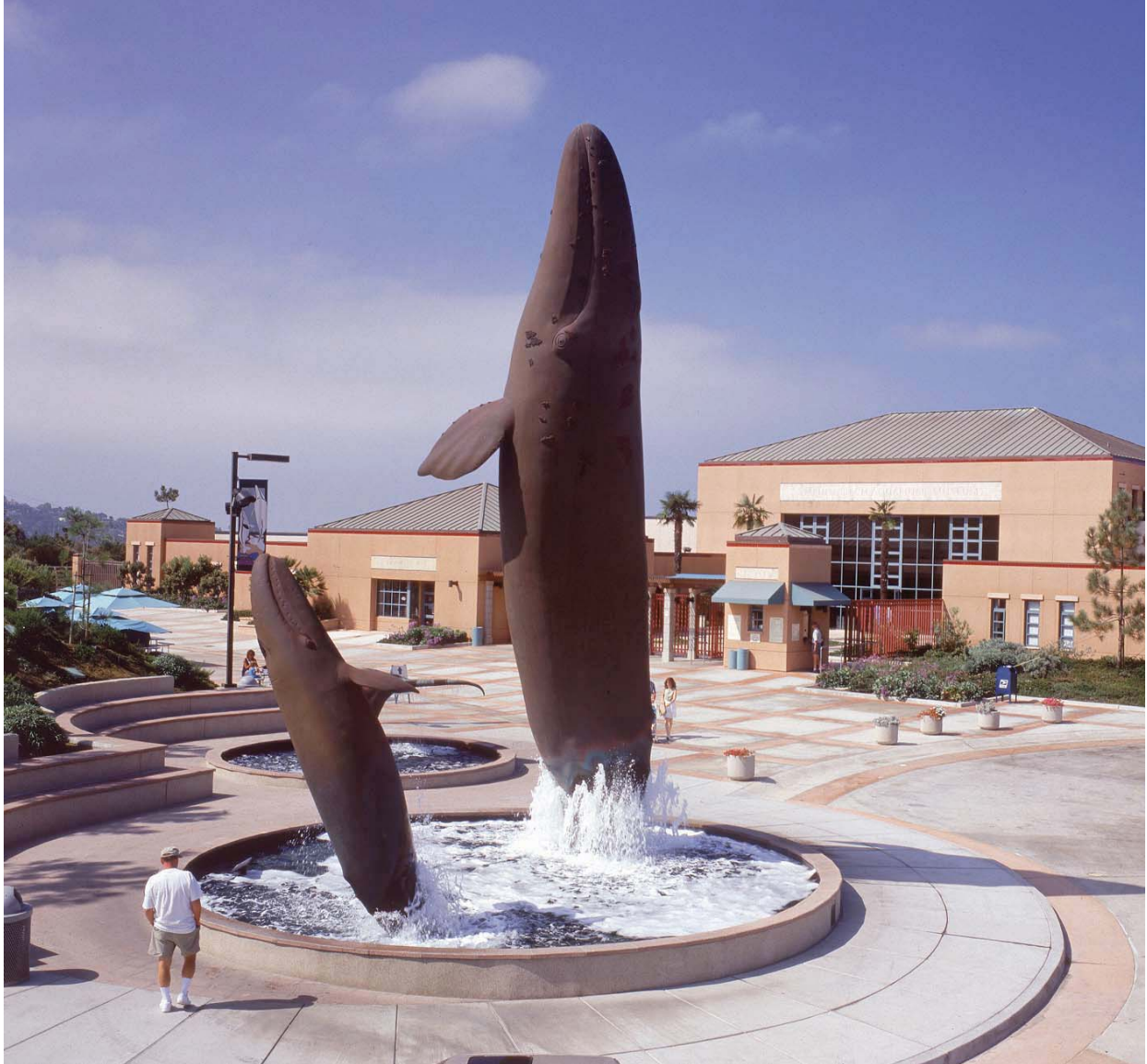
The Birch Aquarium at Scripps, a part of the Scripps Institution of Oceanography at the University of California, San Diego, has extensive exhibit, education, and research programs. The aquarium, founded in 1903, contains more than 5,000 animals representing 380 species and has about 60 tanks of Pacific fishes and invertebrates. This photo shows the aquarium's seaside site in La Jolla.