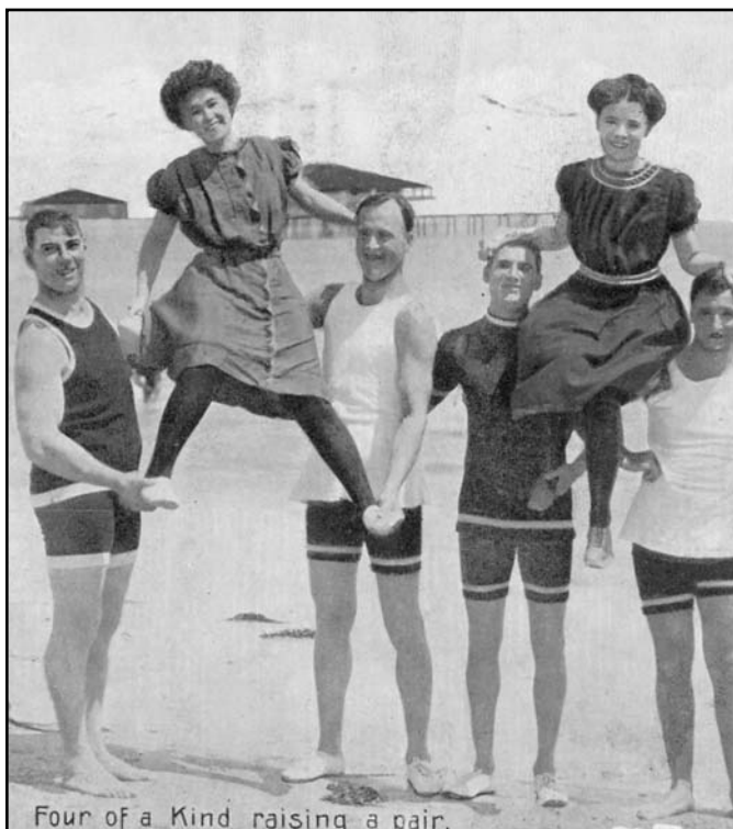
Four of a Kind raising a pair.

One of the family’s first trips abroad was to attend the coronation of King George V.