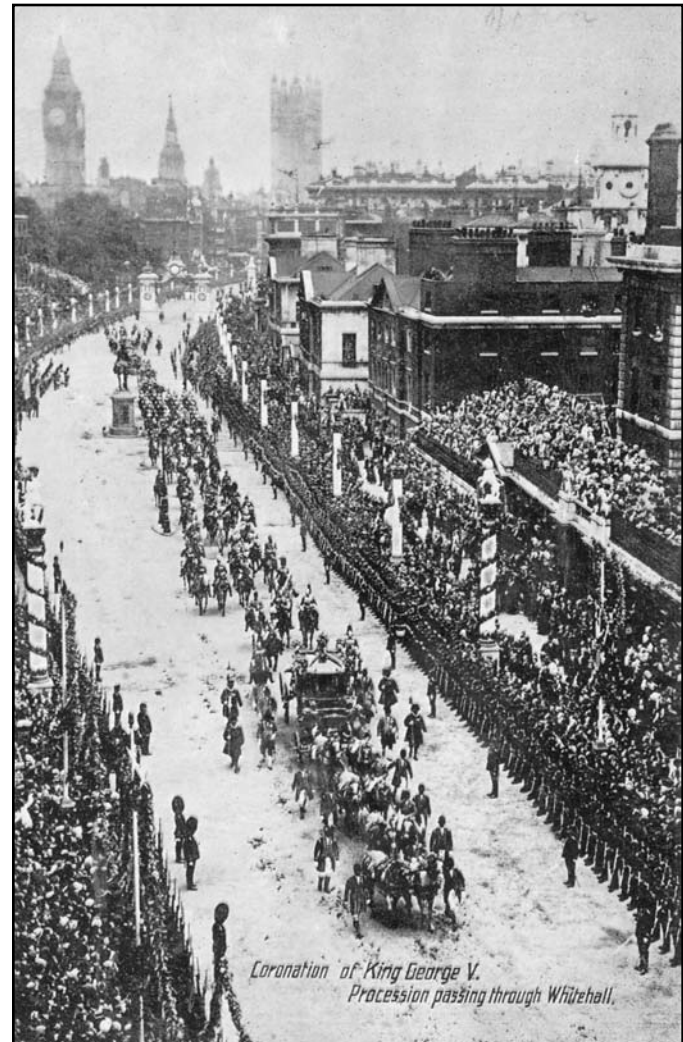
Coronation of King George V. Procession passing through Whitehall.

One of the family’s first trips abroad was to attend the coronation of King George V.