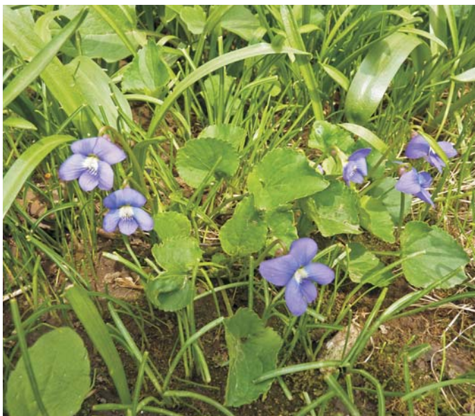
State flower, Common blue violet ( Viola sororia ).