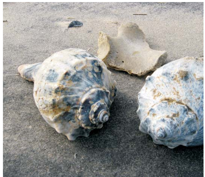
State shell, Knobbed whelk ( Busycon carica gmelin ).