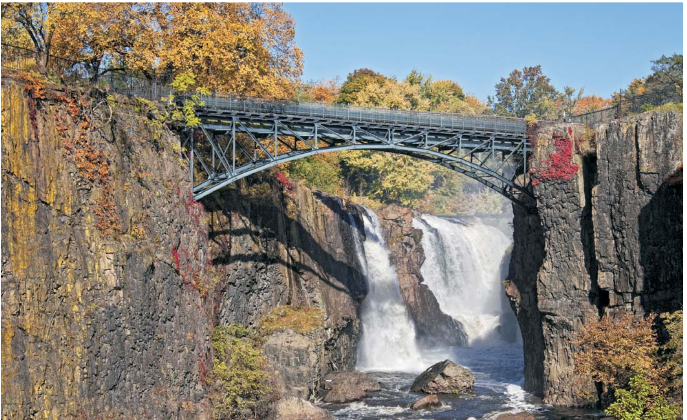
Newark, top, is the largest city in New Jersey, and one of the nation's major air, shipping and rail hubs. Located eight miles west of Manhattan, the city's Port Newark is the largest container shipping terminal on the East Coast, and Newark Liberty International Airport was the country's first municipal commercial airport. Great Falls, bottom, is located on the Passaic River in northern New Jersey. At 77 feet, it is the second highest waterfall on the East Coast. Great Falls was designated a National Natural Landmark in 1967, and was authorized as a National Historical Park in 2009. In 2011, it was formally dedicated at the nation's 397th park system.