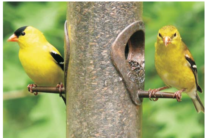
State bird, American goldfinch ( Carduelis tristis ). Male (left) and female (right).